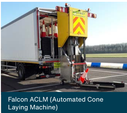
Falcon ACLM (Automated Cone Laying Machine)

'We're very pleased to welcome Highway Care to Upton Business Centre. They are local employers and the extra space we have provided them will enable them to expand their operations. We have the skills and capacity to adapt the premises to Highway Care's requirements and support their plans for the future.'